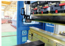
Confirmation with Laser Safe