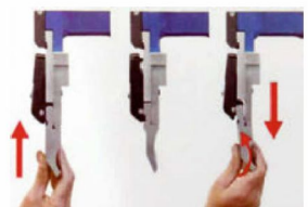
Quick changeable toolings