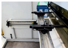
Back gauge and finger