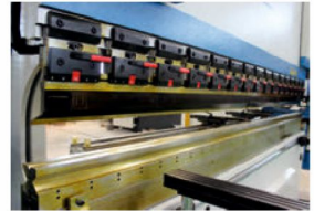
Sectioned Die & Punch 835 mm