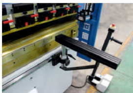
Front sheet support