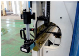
400 mm Throat Depth